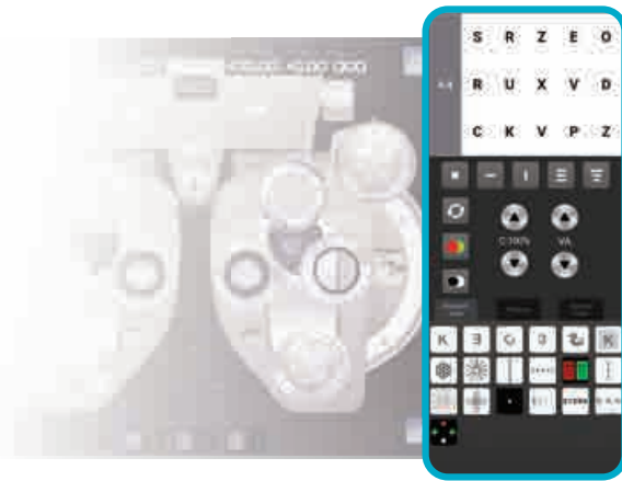
Chart Control VX25 or VX22 family