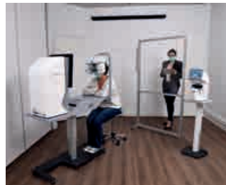
Wireless remote control