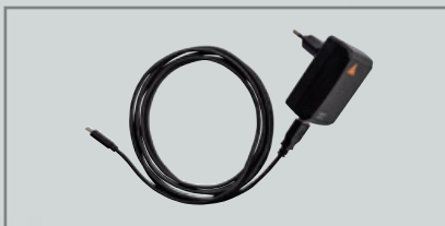
E4-USBC power supply with cable [04]