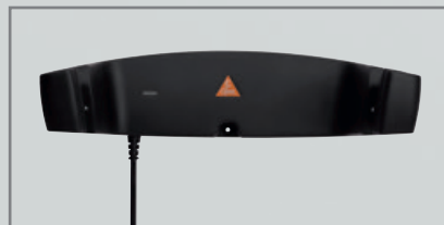
CW1 wall charger [05]