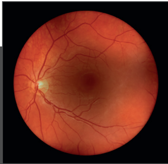
View of a retina through a cataract with visionBOOST*