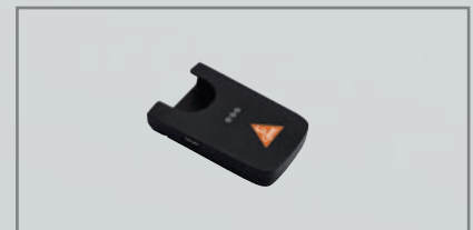
CC1 charging case [02]