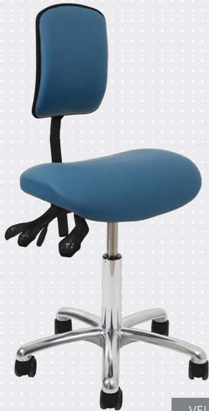
VELA Samba 150