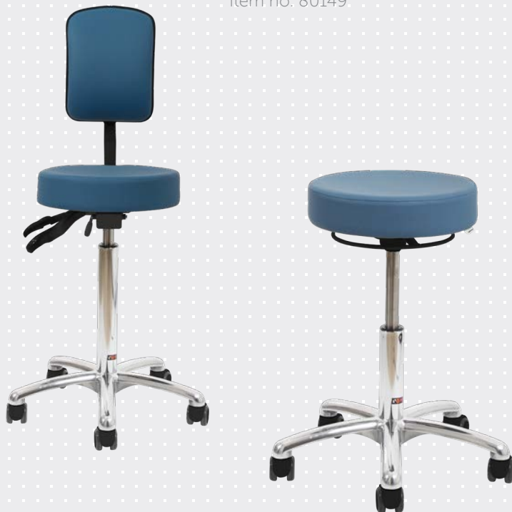
VELA Samba 500