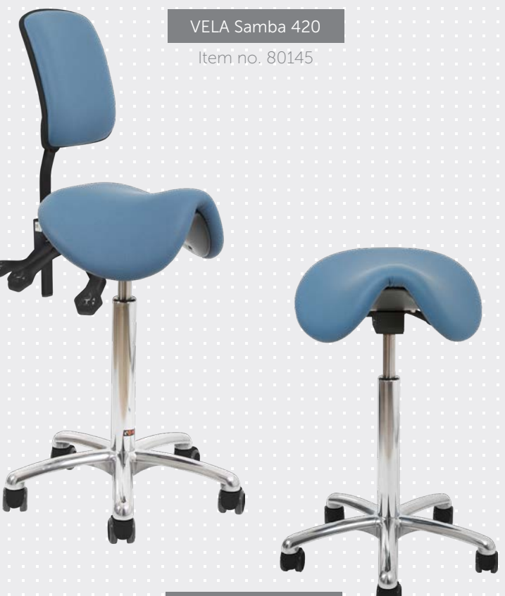
VELA Samba 420