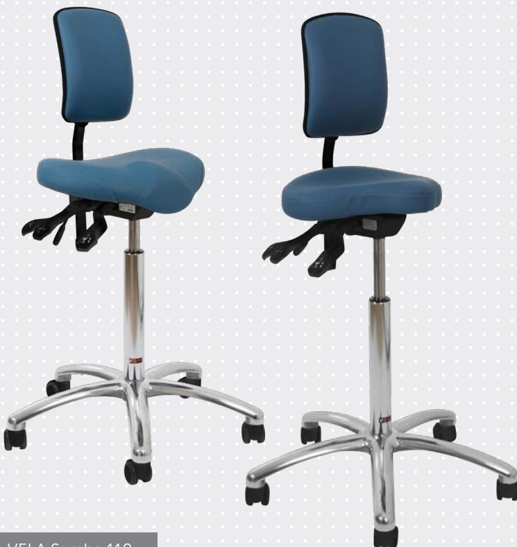
VELA Samba 110